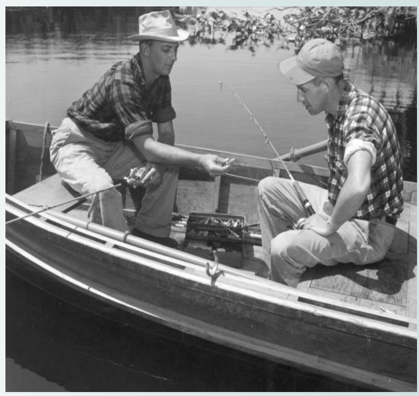
Two fishermen discussing the fishing lure in a boat on the Saint Johns River - Welaka, Florida

January 10-11, 2014 NFLCC Region 3 Winter Show Pigeon Forge, Tennessee